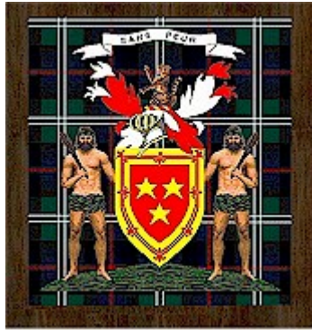
The Countess's Coat of Arms