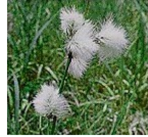
The plant badge, a means of clan identification, was worn on the hat. The Sutherland Plant Badge is Cotton Sedge.

The Motto - The motto of Clan Sutherland is "Sans Peur", which is French for "Without Fear". The War Cry - "Ceann na Drochaide Bige", meaning "The Head of the Little Bridge" The official pipe music - "The Earl of Sutherland's March".